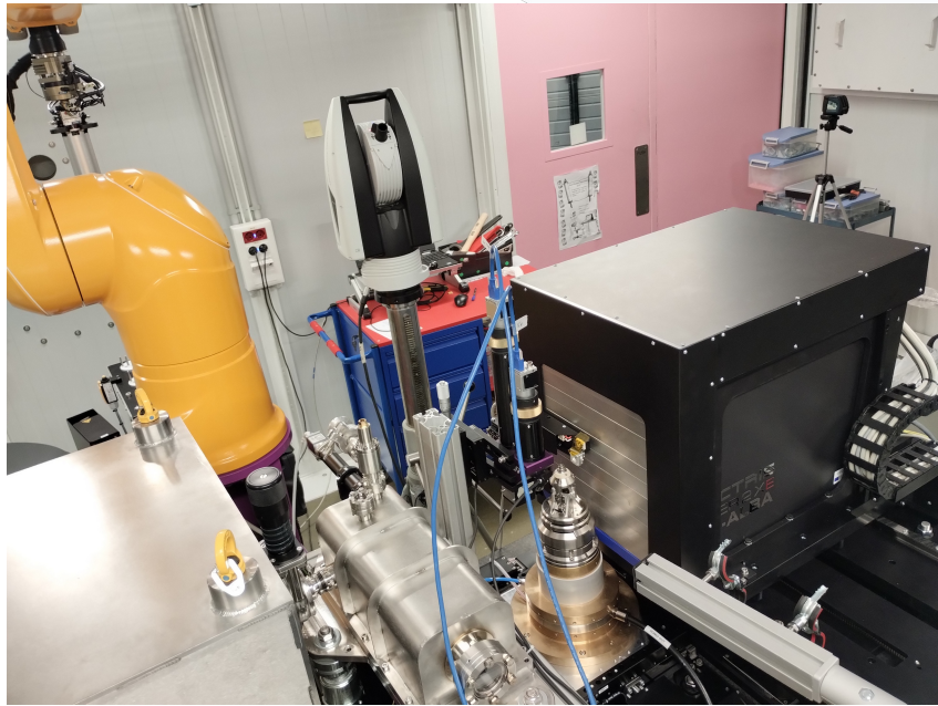
MXCuBE / ISPyB Meeting